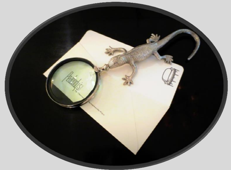
Reptile Magnifying Glass